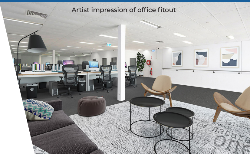
Artist impression of office fitout