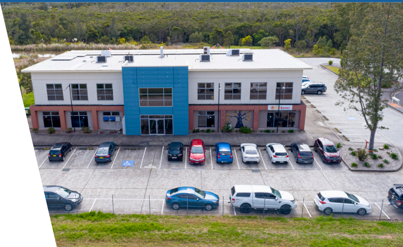
Golfinks Commercial Campus: Building 8